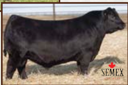
SAV RENOVATION 6822 - Produced from a flush sister to the dam of Lots 3 through 3D.