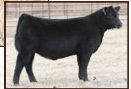
PAYNE DUKE GIRL 8100 - $27,500 maternal sister to Lots 1, 1A, 41, 42 and 43.