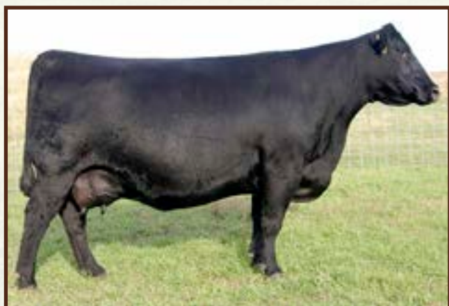
SAV MADAME PRIDE 0075 - Dam of Lot 2.