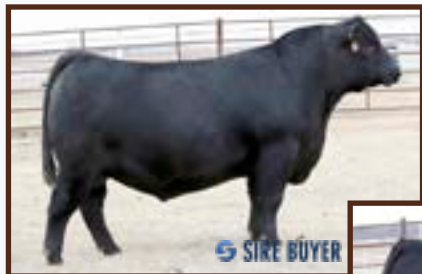
PAYNE FUNDAMENTAL 7137 - Maternal brother to Lots 1, 1A, 41, 42 and 43 in the Janssen, Foster and Sire Buyer programs.