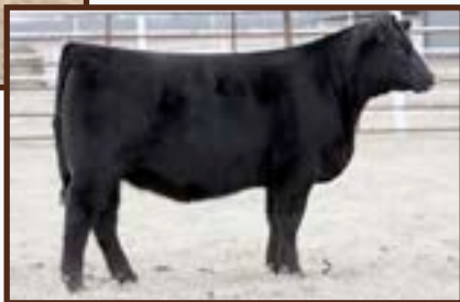
PAYNE PRIMROSE 8003 - $9,500 maternal sister to Lot 75.