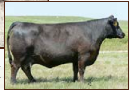
SAV ABIGALE 1674 - Grandam of Lot 18.