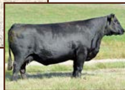
SAV MADAME PRIDE 0239 - Dam of Lots 3 through 3D.