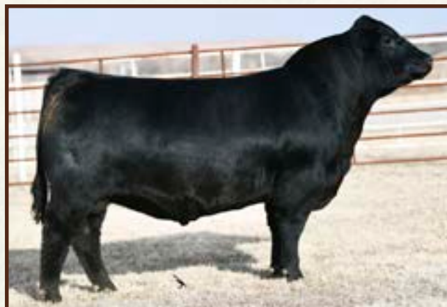
PA PRESIDENT 8150 - Lot 55