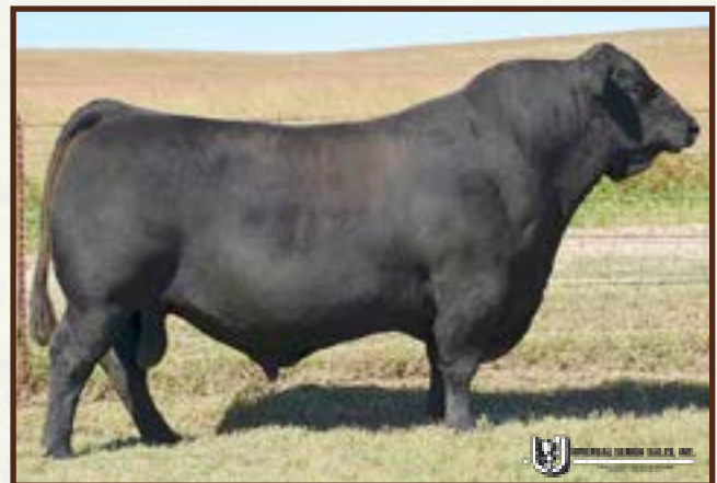
SAV REAL ESTATE 3159