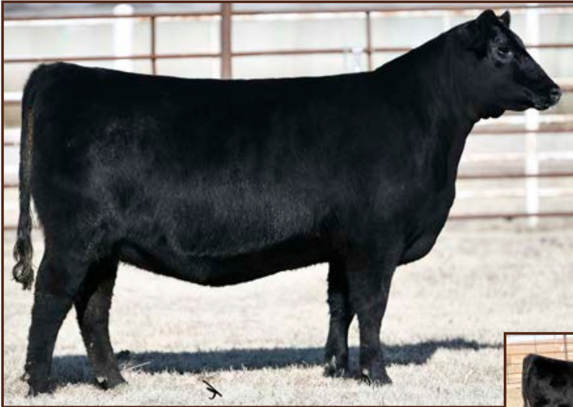
PAYNE DUKE GIRL 8130 - Lot 1