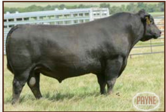
SAV HOPPER BOTTOM 2144