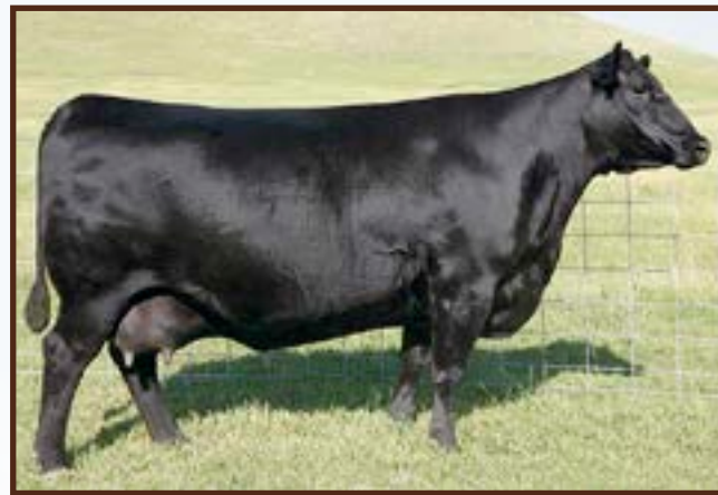
SAV MADAME PRIDE 5645 - Third dam of Lots 4, 5 and 6.