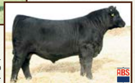
SAV SOLID GOLD 9187 - $24,000 maternal brother to Lots 1, 1A, 41, 42 and 43.