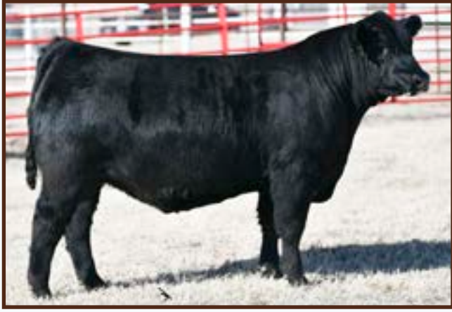
PAYNE UNIVERSAL 9236 - Lot 66