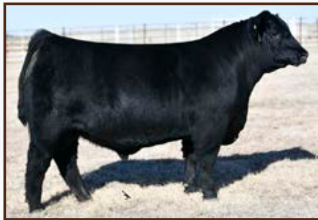
PAYNE PRESIDENT 9235 - Lot 52