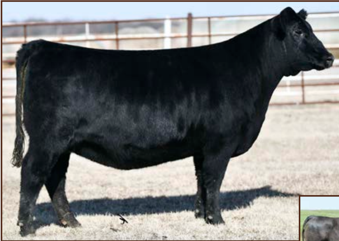
PAYNE ABIGALE 8115 - Lot 18