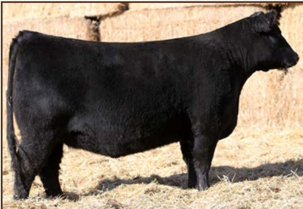
NCC PRIMROSE 826 - Lot 34