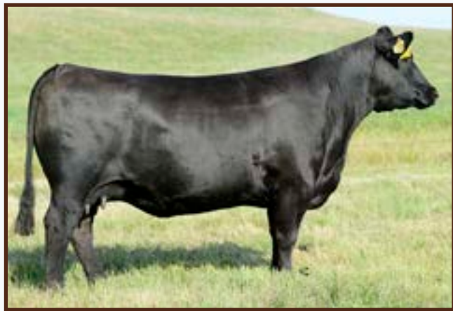
PAR LADY IDEAL 4465 1010 - Dam of Lots 25 and 26.