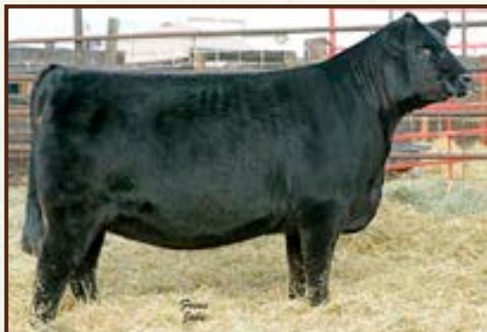
MCCURRY MISS WIX 4125 - Dam of Lots 84 through 87.

These full brothers by SAV President 6847 are from a proven donor dam with a progeny weaning ratio of 102 on two calves with two daughters in production who post a collective progeny weaning ratio of 103 on their first calves.