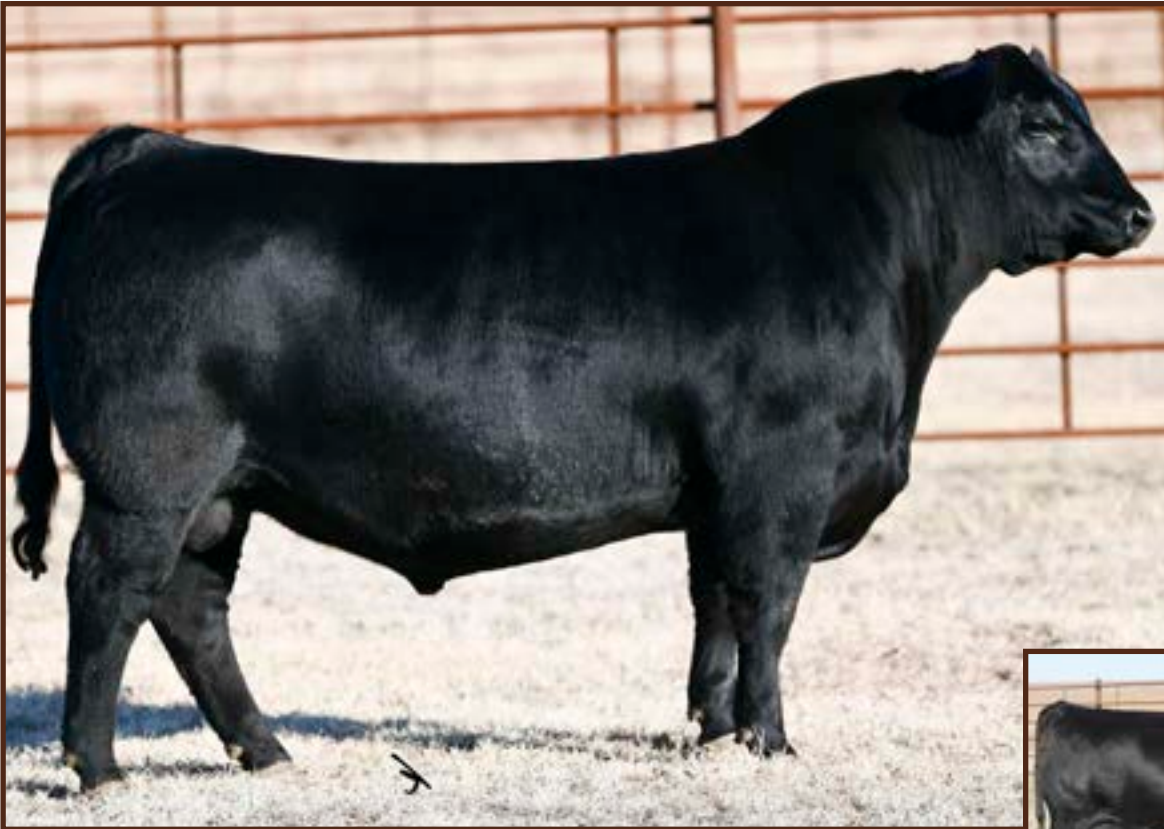
PAYNE SENSATION 8107 - Lot 62