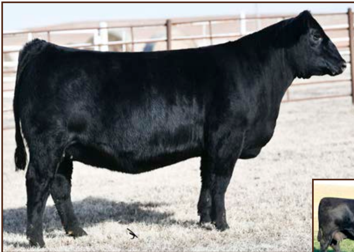
PA EMBLYNETTE 8162 - Lot 8