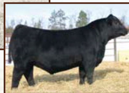
SAV EXECUTIVE CHIEF 9563 - Three-quarter brother to Lot 2A.