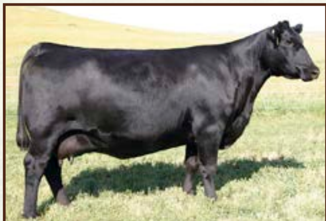
AC DUKE GIRL 57 - $53,000 Pathfinder Dam of Lots 1, 1A, 41, 42 and 43.