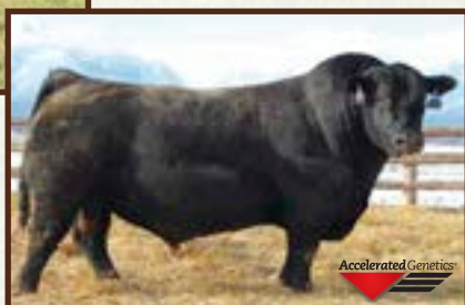
COLEMAN CHARLO 0256 - Maternal brother to the dam of Lots 81 and 82.