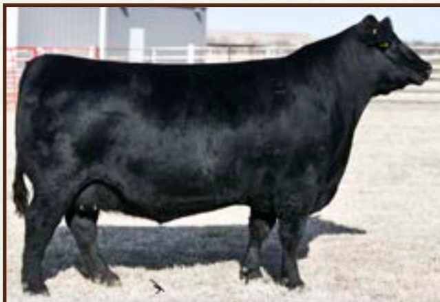
SAV MADAME PRIDE 5808 - Grandam of Lot 73.