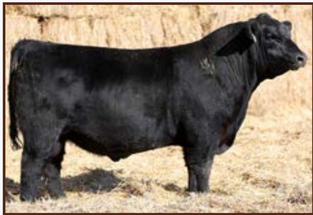
NCC PRESIDENT 8105 - Lot 88