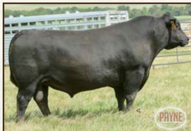
SAV HOPPER BOTTOM 2144 - $90,000 sire of Lots 5, 6 and 7.