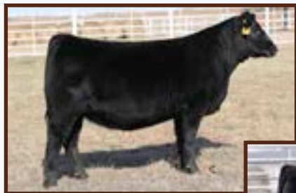
PAYNE BLACKCAP MAY 7026 - Full sister to Lot 66 and to the dam of Lot 71.