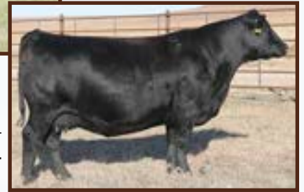
SAV EMBLYNETTE 3557 - Dam of Lot 68.