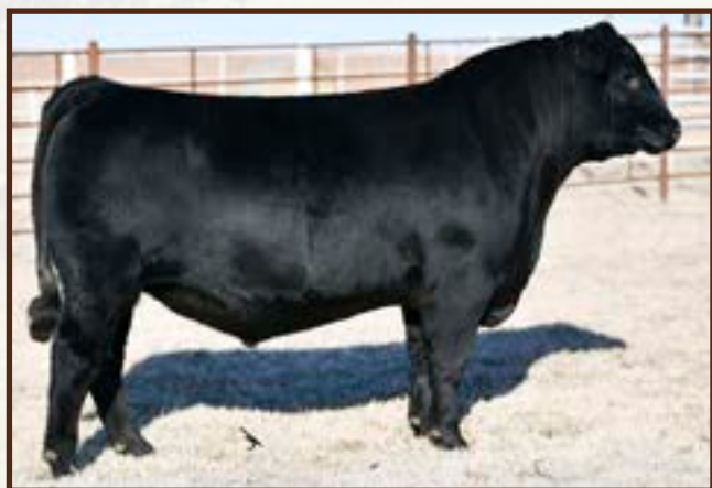
PAYNE RAINDANCE 8133 - Lot 42