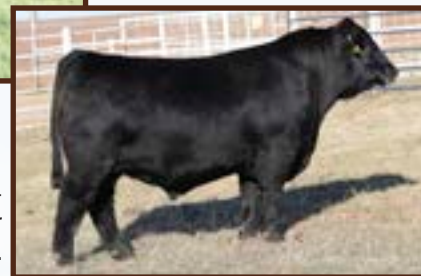
PA RECHARGE 7050 - $13,000 maternal brother to Lots 9 and 48.