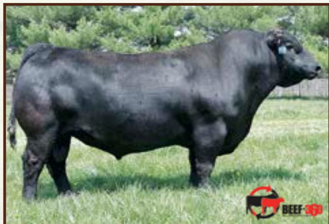
LD CAPITALIST 316