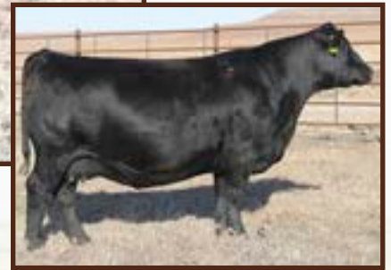
SAV EMBLYNETTE 3557 - Grandam of Lot 62.