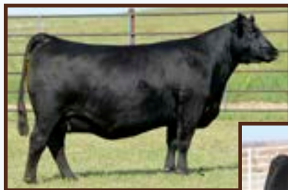
PAR ABIGALE 8025 - Dam of Lot 52