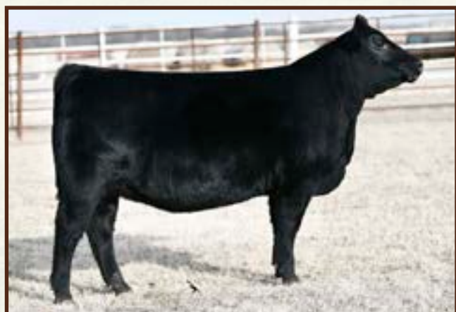
PA MADAME PRIDE 9201 - Lot 3A