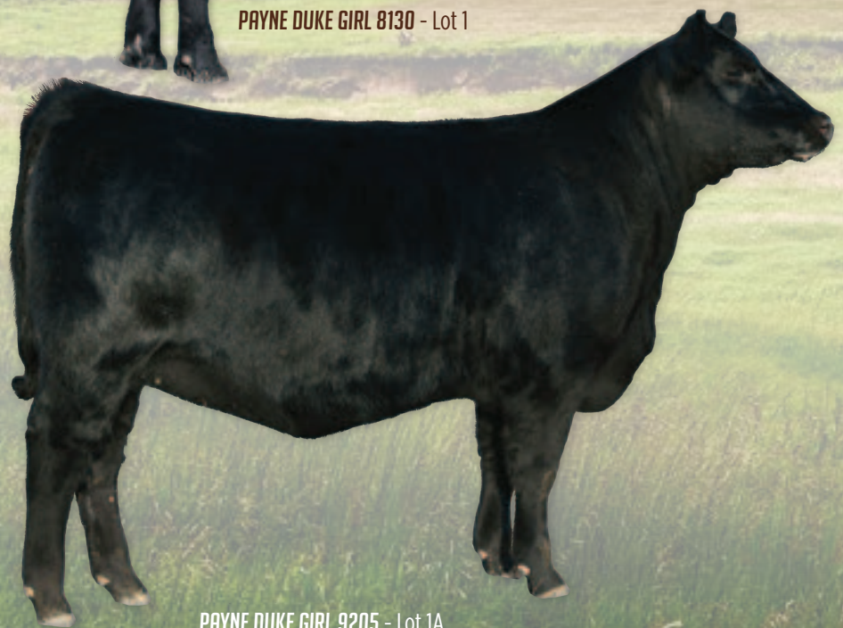
PAYNE DUKE GIRL 9205 - Lot 1A

With Special Guests Howell Angus & Naylor Cattle Company