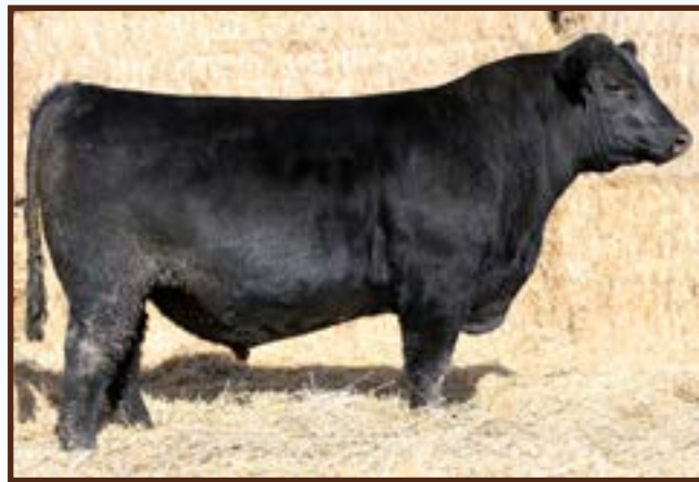
NCC RENOWN 8108 - Lot 91