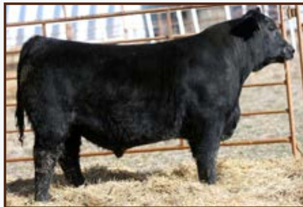
NCC CAPITALIST 931 - Lot 77