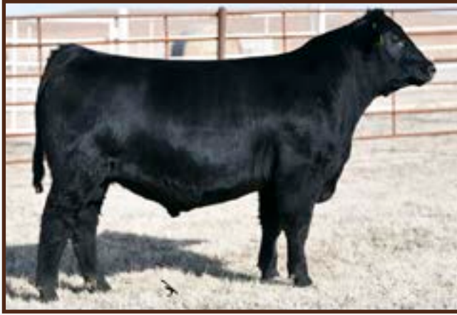
PA SENSATION 9232 - Lot 57