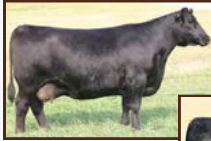
SAV EMBLYNETTE 7566 - Grandam of Lots 9, 48 and 56.