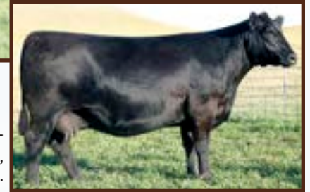
SAV EMBLYNETTE 7563 - Grandam of Lots 8, 8A, 8B, 44, 45 and 57 through 61.