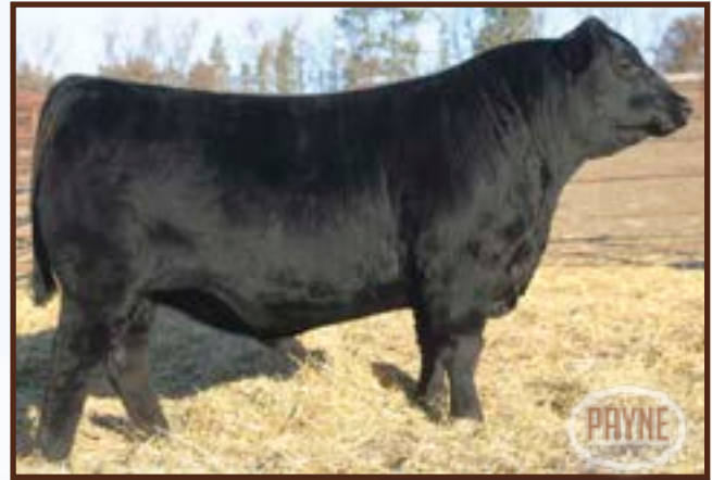
SAV LIEUTENANT 7218