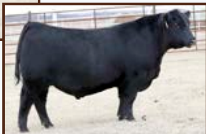
PAYNE RESOURCE 7146 - Maternal brother to Lots 1, 1A, 41, 42 and 43 in the Carlson Angus program in North Dakota.