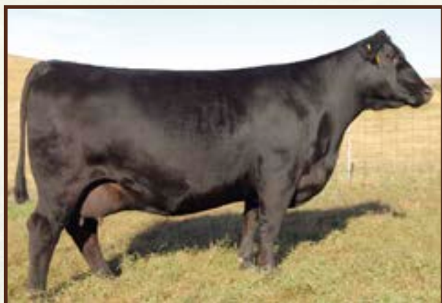
SAV EMBLYNETTE 9811 - Dam of Lot 12.