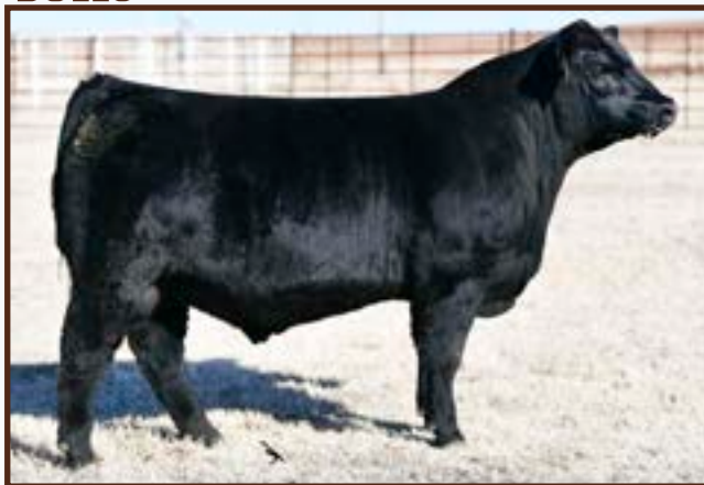
PAYNE CAPITALIST 9243 - Lot 71