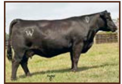
WHITESTONE ABIGALE 814A - $23,000 dam of Lots 33, 81 and 82.