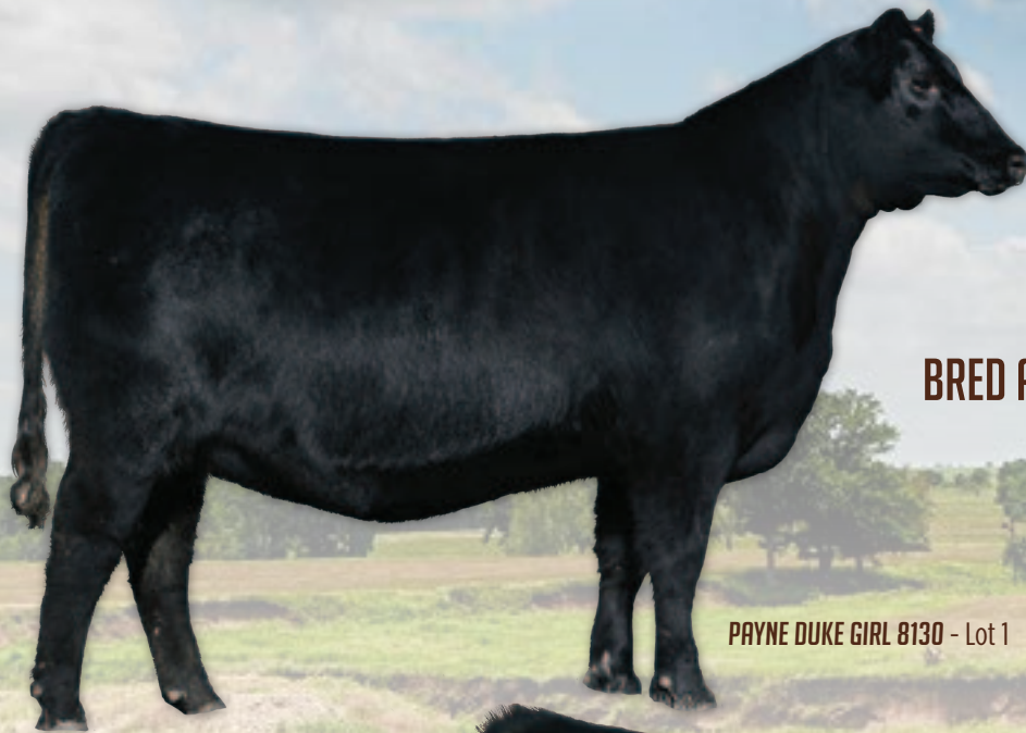
PAYNE DUKE GIRL 8130 - Lot 1

55 ANGUS FEMALES COW/CALF PAIRS, BRED AND OPEN HEIFERS, OPEN DONOR