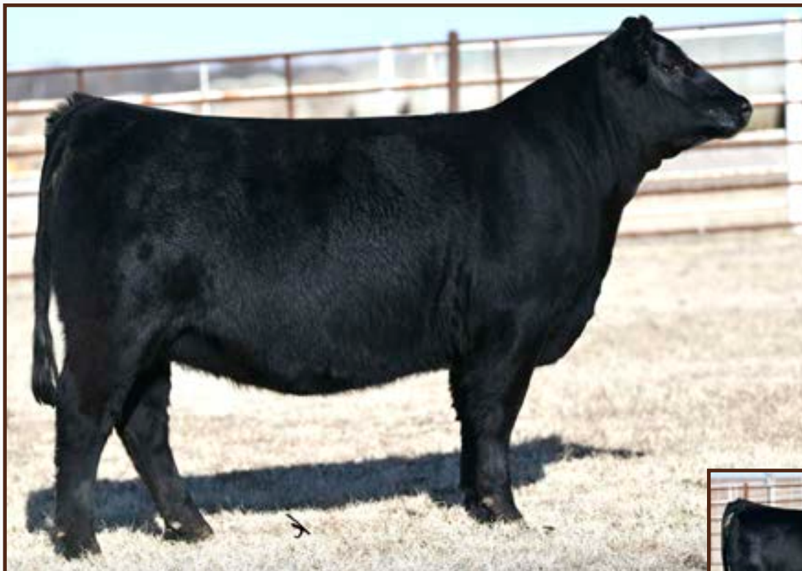
PAYNE ENCHANTRESS 8105 - Lot 20B