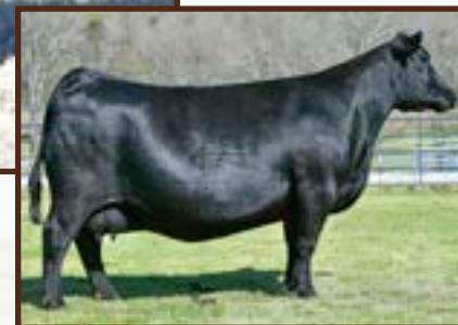
SAV ELBA 0522 - $50,000 full sister-in-blood to the grandam of Lot 21.