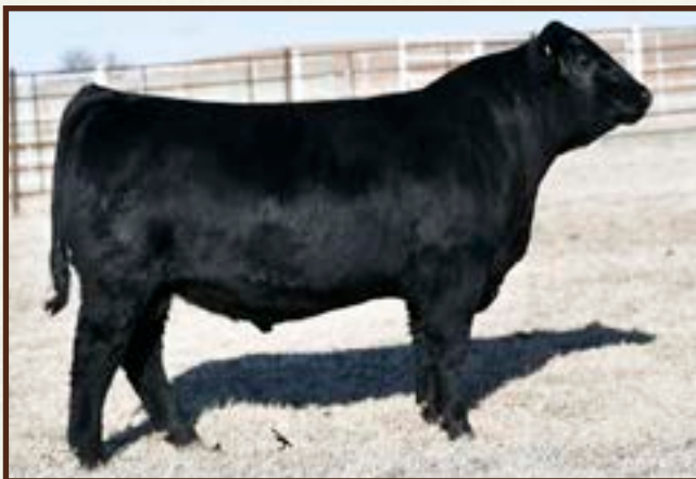
PA SENSATION 9247 - Lot 61