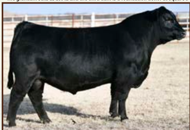
PAYNE PRESIDENT 8135 - Lot 50