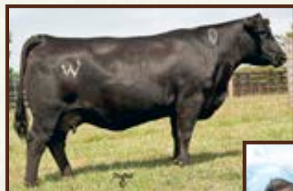
WHITESTONE ABIGALE 814A - $23,000 dam of Lots 81 and 82.

A blending of maternal brothers SAV Sensation 5615 and SAV Resource 1441 produced from a dam who is a product of the embryo program, stemming from the Naylor foundation donor Moonshadow Erica 42.