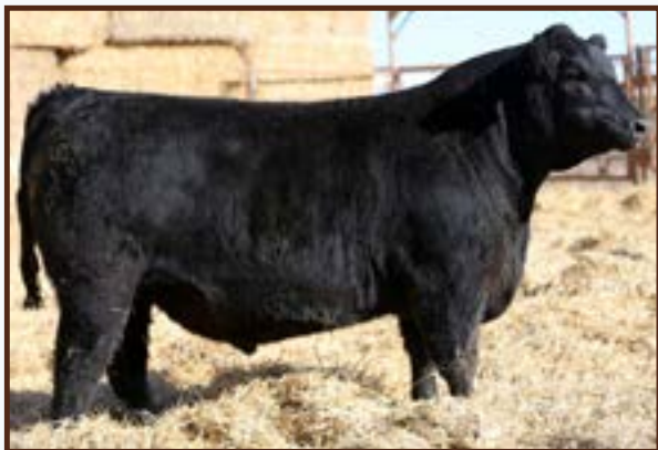
NCC CAPITALIST 927 - Lot 76