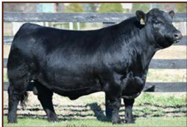
SAV AMERICA 8018