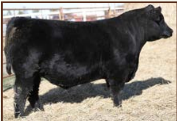
NCC CAPITALIST 916 - Lot 78

• This bull has an individual birth ratio of 92 combined with an individual weaning ratio of 109 sired by LD Capitalist 316 and produced as the first calf from a two-year-old dam by SAV Renown 3439. • The $23,000 grandam is a maternal sister to Coleman Charlo 0256.