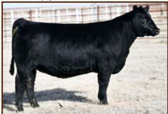
PA EMBLYNETTE 8163 - Lot 8A.