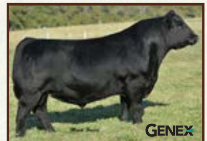
PVF INSIGHT 0129 - Sire of Lots 33 and 34.