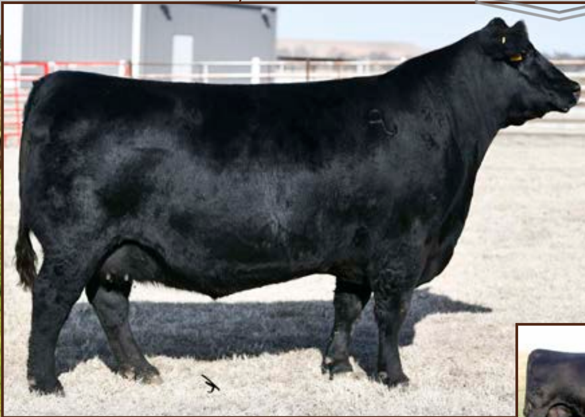
SAV MADAME PRIDE 5808 - Lot 2