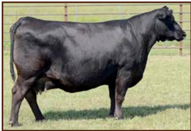
SAV EMBLYNETTE 1192 - Lot 12