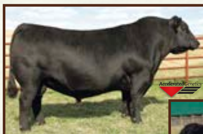
SAV REGISTRY 2831 - $90,000 maternal brother to Lot 2.