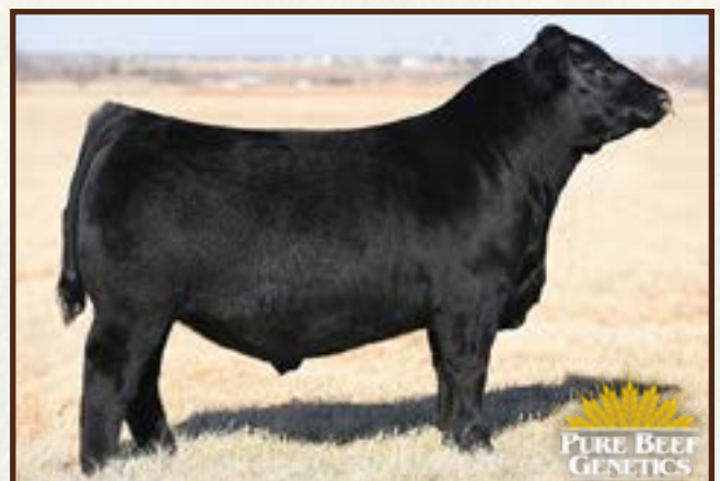
WLTR RECOLLECTION 1501 ET - Full brother to Lots 39 and 40.