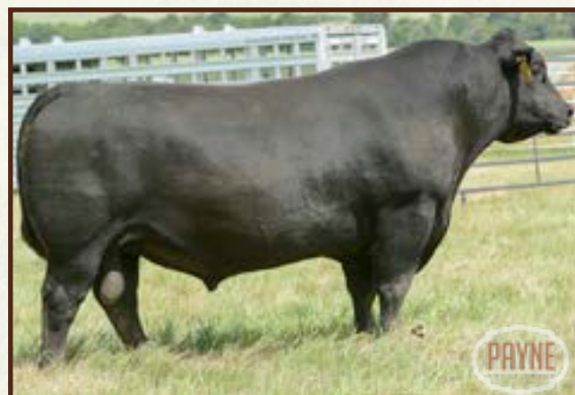
SAV HOPPER BOTTOM 2144 - $90,000 maternal brother to Lot 2.