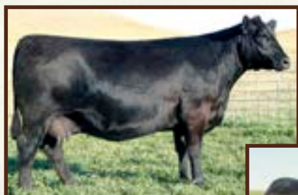
SAV EMBLYNETTE 7563 - Grandam of Lots 8, 8A, 8B, 44, 45 and 57 through 61.