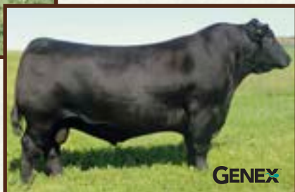
SAV ABUNDANCE 6117 - Maternal brother to the dam of Lots 8, 8A, 8B, 44, 45 and 57 through 61.