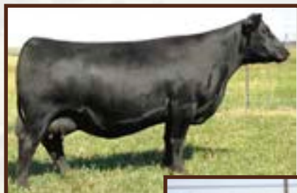
SAV MADAME PRIDE 0151 - $37,500 flush sister to the dam of Lots 3 through 3D.