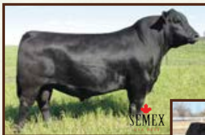
SAV REVERE 1180 - $120,000 maternal brother to Lots 1, 1A, 41, 42, and 43.