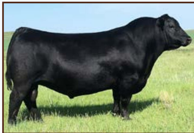
SAV PRESIDENT 6847