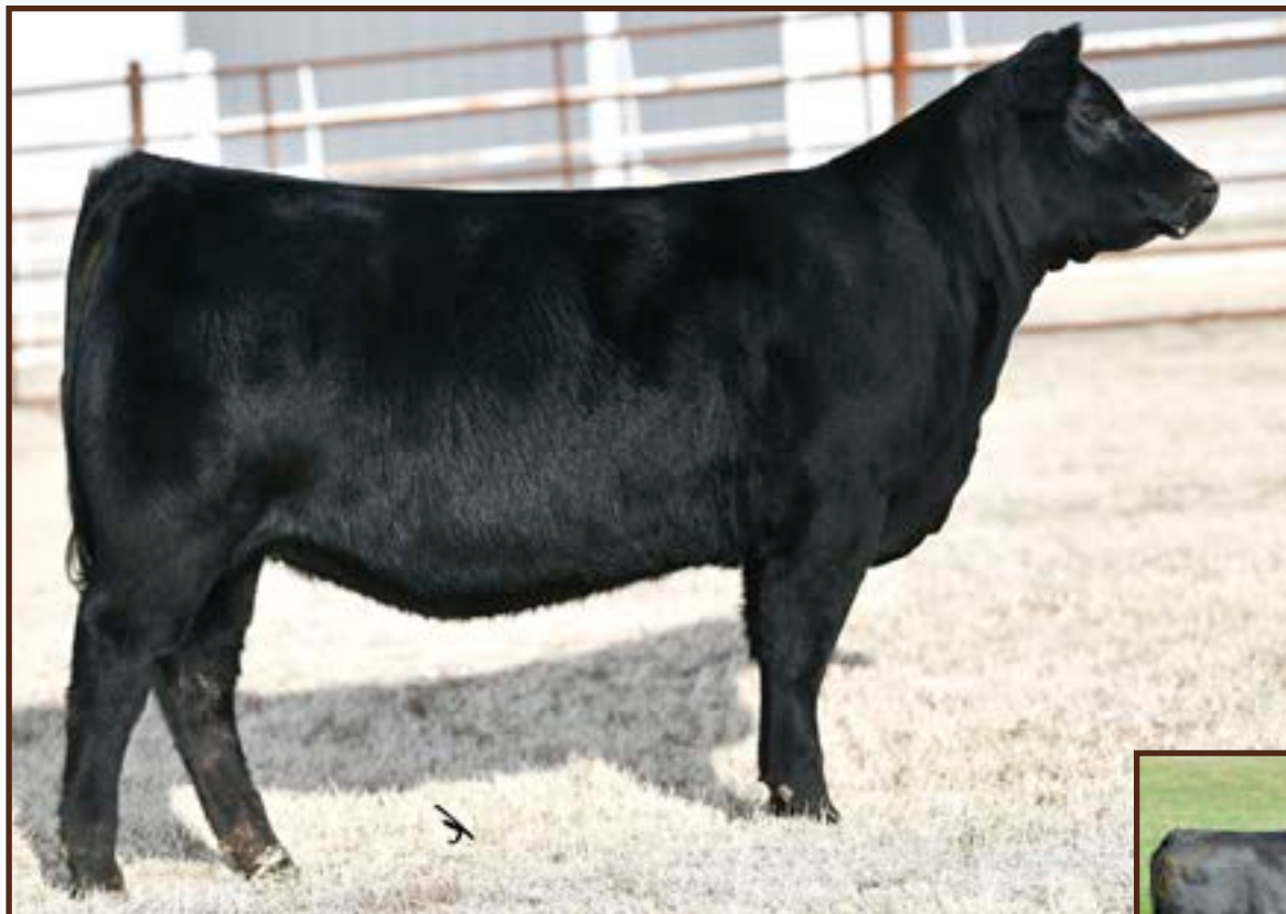
PA MADAME PRIDE 9200 - Lot 3