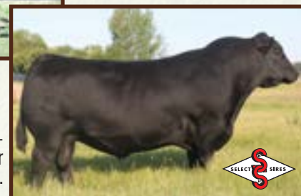
SAV SUPERCHARGER 6813 - $235,000 maternal brother to Lot 2.