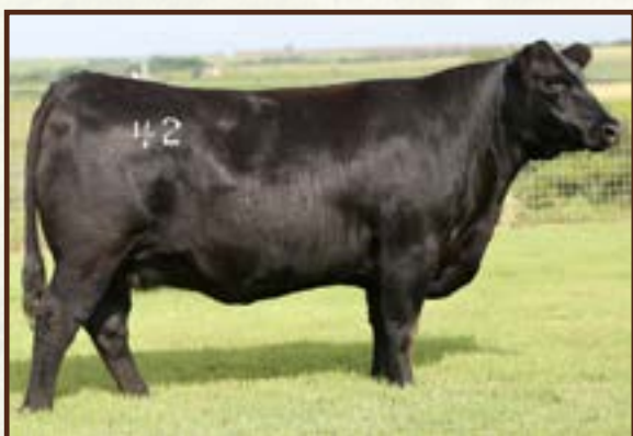
MOONSHADOW ERICA 42 - Dam of Lots 89 and 90 and grandam of Lots 83, 88 and 95.

• These sons of SAV President 6847 from the Naylor embryo program are from a donor dam with a progeny weaning ratio of 105 on four natural calves, backed by multiple generations of Pathfinder Dams.