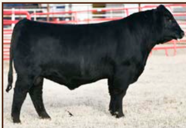
PAYNE RAINDANCE 8121 - Lot 47