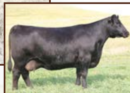
SAV EMBLYNETTE 7566 - Grandam of Lots 9, 48 and 56.