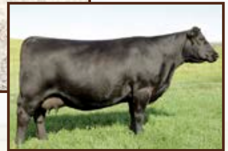
SAV ERICA 9448 - Pathfinder grandam of Lot 23.