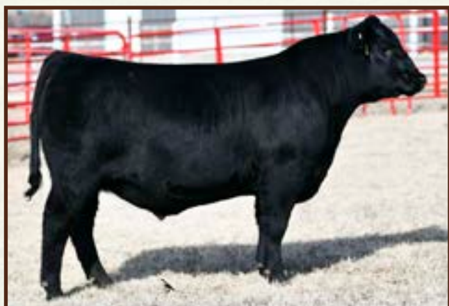
PAYNE RAINDANCE 9244 - Lot 43