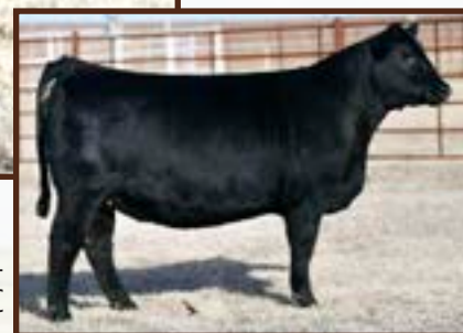
PAYNE ENCHANTRESS 8104 - Lot 20C