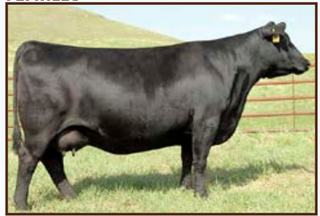
SAV MADAME PRIDE 0290 - Grandam of Lot 28.