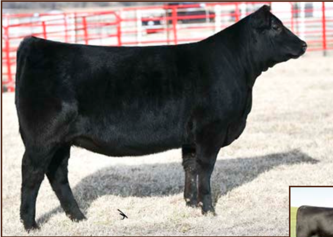
PAYNE ERICA 9204 - Lot 23