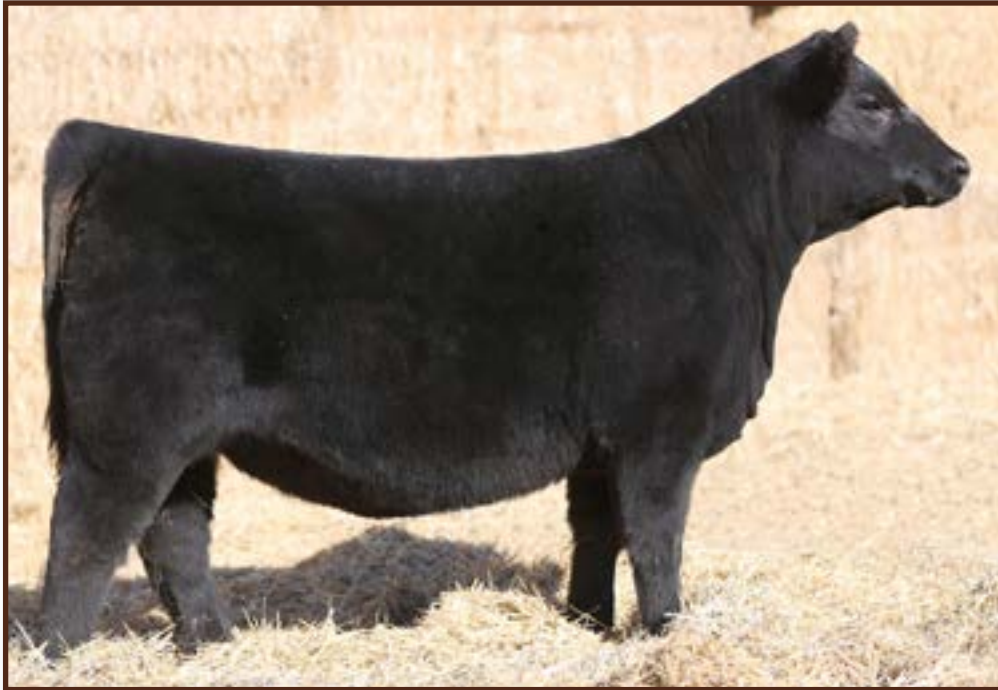
NCC ABIGALE 901 - Lot 33