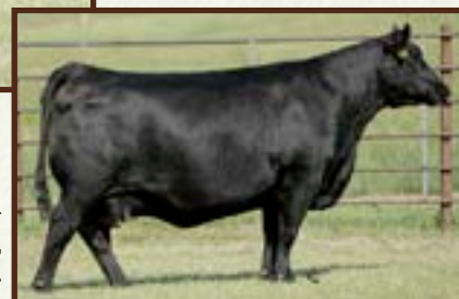
PAR BLACKCAP MAY A022 - Maternal sister to Lots 15, 15A, 50, 51 and 66.