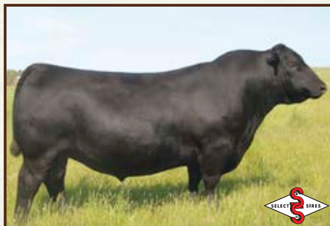
SAV RAINFALL 6846