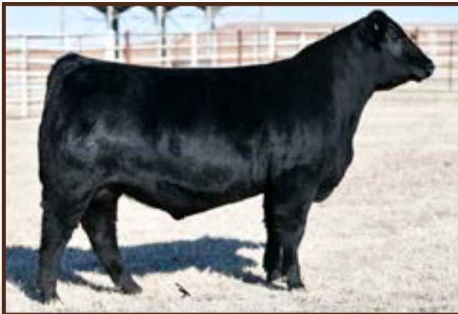
PA SENSATION 9233 - Lot 58