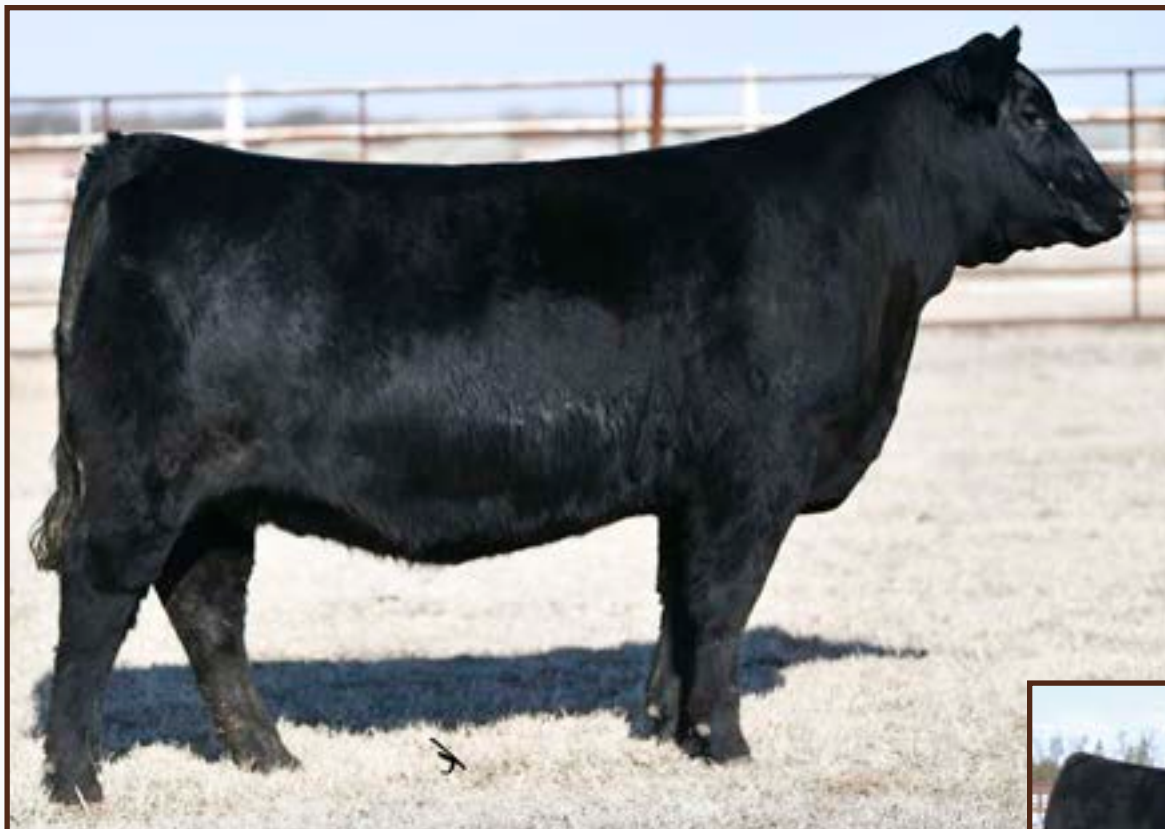
PAYNE MADAME PRIDE 8110 - Lot 2A