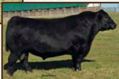
SAV RESPONSE 2411 - $90,000 maternal brother to Lot 2.