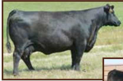
SAV BLACKCAP MAY 1267 - Dam of Lots 15, 15A, 50, 51 and 66.