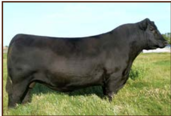
SAV ELATION 7899