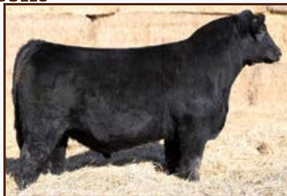
NCC SENSATION 8103 - Lot 84