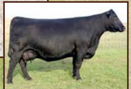
SAV MADAME PRIDE 0075 - Dam of Lot 2.