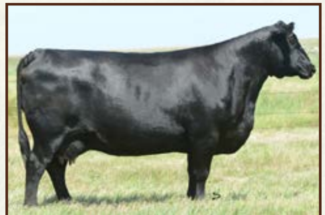
KLR RITA 0011 - Dam of Lot 24.