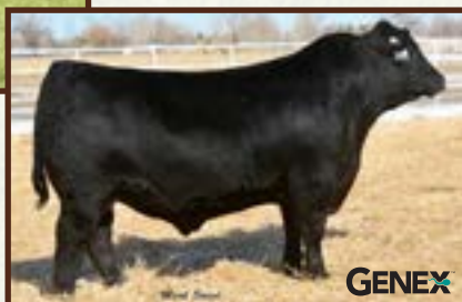
SAV DON PEPE 4443 - $31,000 maternal brother to Lots 1, 1A, 41, 42 and 43.