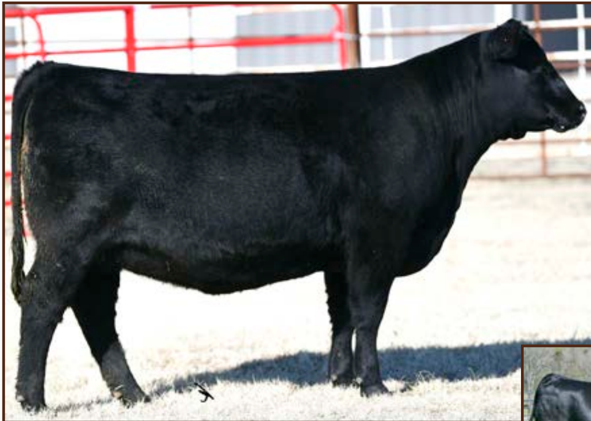
PAYNE ELBA 8117 - Lot 21