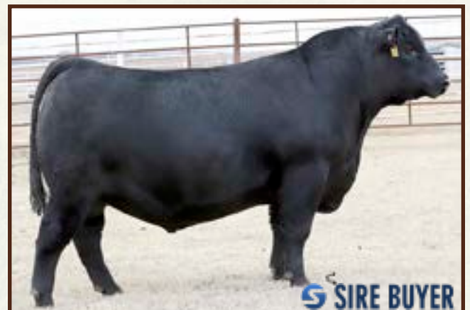
PAYNE FUNDAMENTAL 7137 - Maternal brother to Lots 1, 1A, 41, 42 and 43.