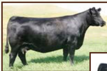
SAV DUKE GIRL 7348 - This maternal sister to Lots 1, 1A, 41, 42 and 43 is the Pathfinder Dam of three AI sires.