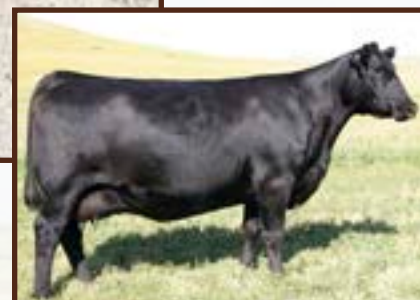
AC DUKE GIRL 57 - $53,000 Pathfinder Dam of Lots 1, 1A, 41, 42 and 43.