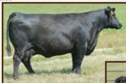
SAV BLACKCAP MAY 1267 - Dam of Lots 15, 15A, 50, 51 and 66.