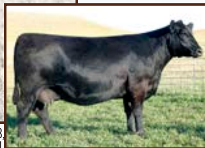
SAV EMBLYNETTE 7563 - Grandam of Lots 8, 8A, 8B, 44, 45 and 57 through 61