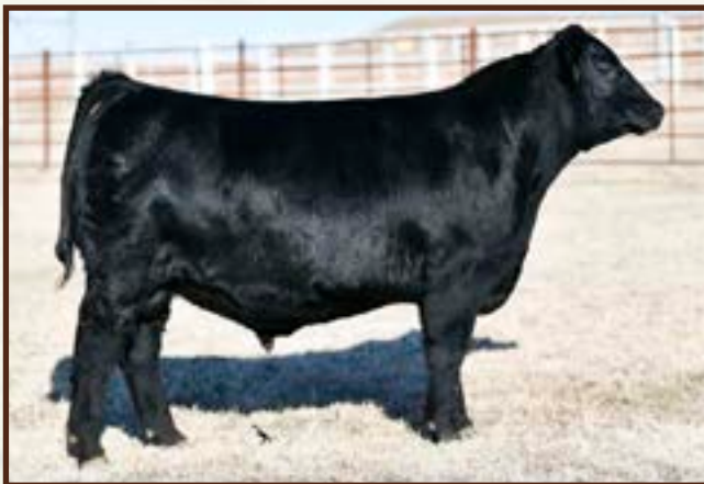
PA SENSATION 9234 - Lot 59