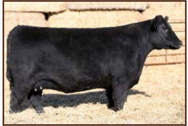
NCC DUKE GIRL 713 - Lot 35