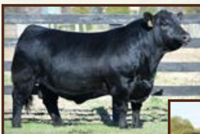
SAV AMERICA 8018 - $1.51 million world record-selling maternal brother to Lot 2.