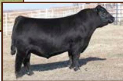
PAR VELOCITY 6119 - $11,500 maternal brother to Lot 52.