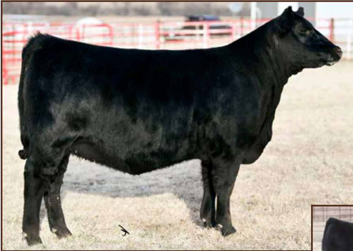
PAYNE DUKE GIRL 9205 - Lot 1A