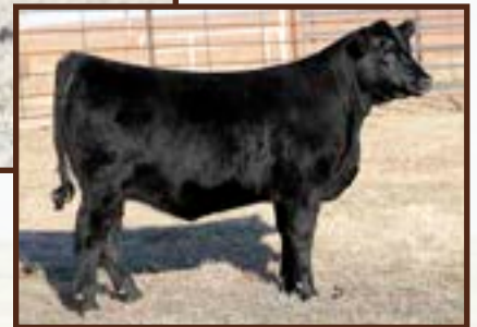
PAYNE DUKE GIRL 7032 - $22,000 maternal sister to Lots 1, 1A, 41, 42 and 43.