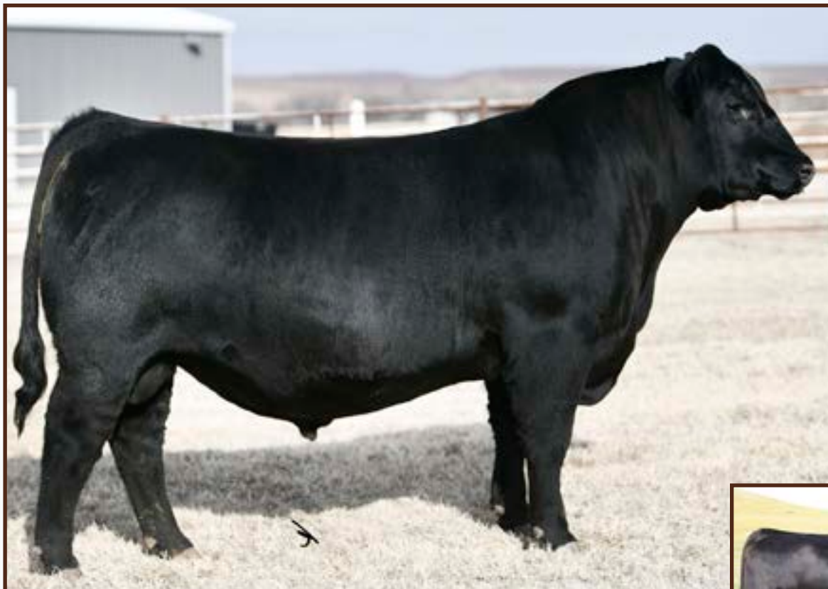
PAYNE RAINDANCE 8132 - Lot 41