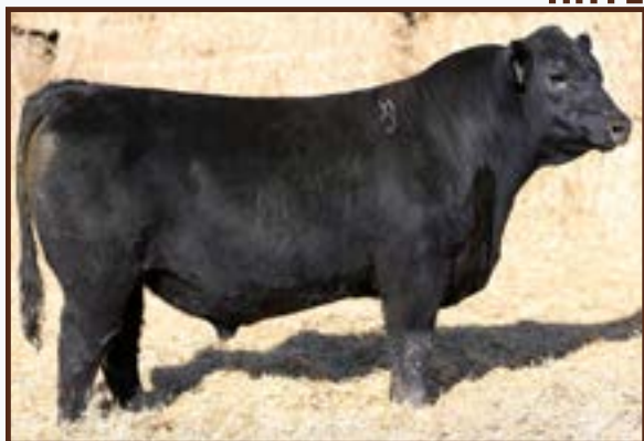
NCC SENSATION 8101 - Lot 81