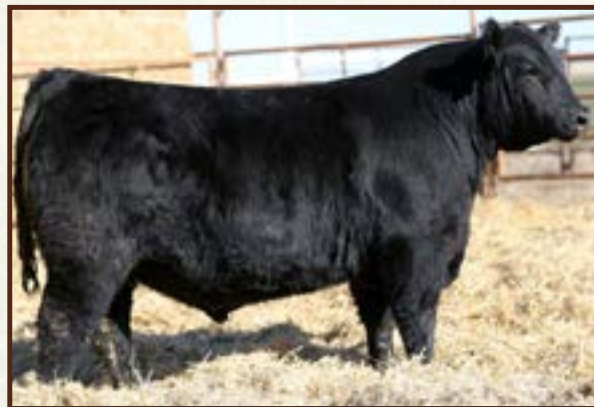
NCC CAPITALIST 918 - Lot 80

• A royally-bred herd sire prospect by LD Capitalist 316 produced as the first calf from a two-year-old dam by SAV Renown 3439. • The grandam is the prolific SAV Madame Pride 9803.