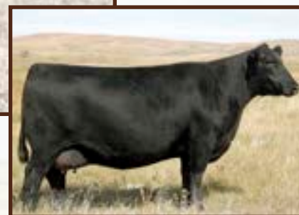
SAV MADAME PRIDE 5809 - Flush sister to Lot 2.