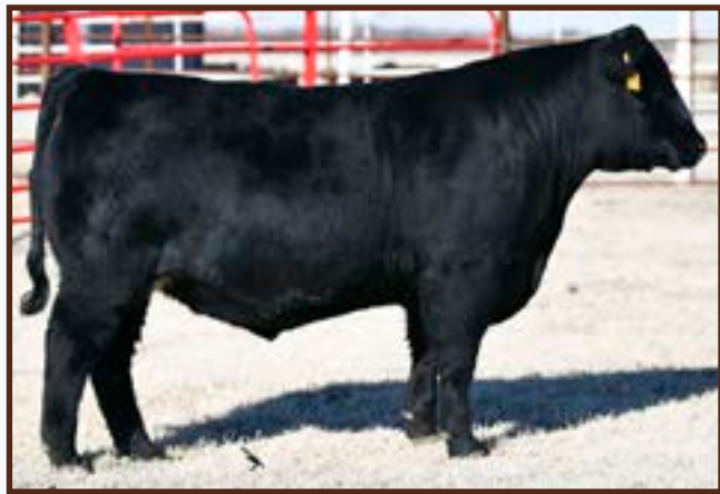
PA PRESIDENT 9230 - Lot 48