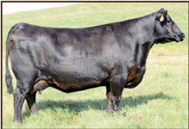
SAV ELBA ERICA 9327 - Dam of Lot 67.